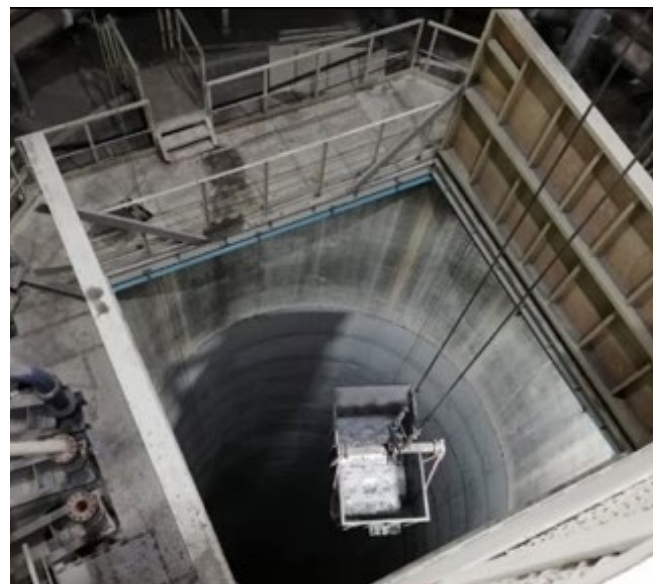
Work progress on the skip shaft

The drivage required the drilling of 44 freezing wells, each 169m deep, and 4 pilot thermal wells, each 171m deep.