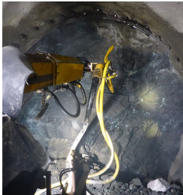
Shotcrete the mine face

At the horizon of -480m (depth of approximately 900m), the customer plans to implement a total of 12km of horizontal mine workings. In addition, one more production horizon below the -560 m mark will facilitate further exploration work.