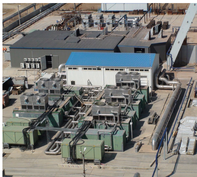
Ground freezing plant complex

are continuously visualized and monitored. The team of THYSSEN SCHACHTBAU specialists continuously maintains the plant twenty-four hours a day on site, ensuring its reliable and trouble-free operation.